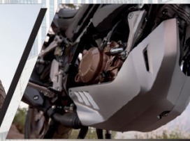
ADVENTURE STYLE UNDERCOWL