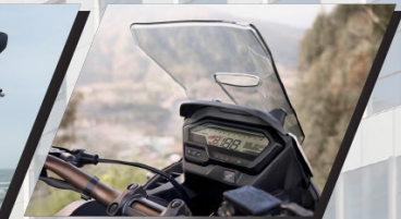
FULL DIGITAL METER PANEL