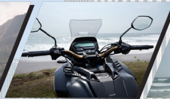
TAPERED HANDLEBAR & COCKPIT DESIGN