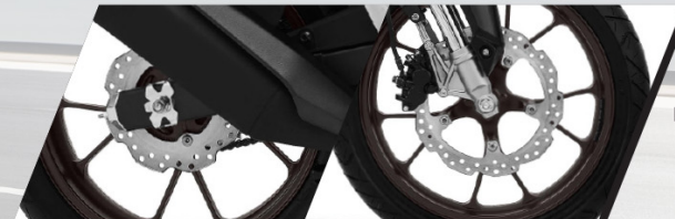
FRONT AND REAR WAVY DISC BRAKE