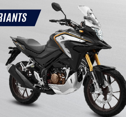
MATTE GUNPOWDER BLACK METALLIC