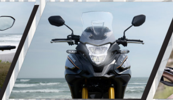
ALL LED LIGHTING SYSTEM