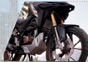
INVERTED FRONT SUSPENSION