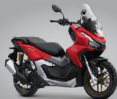
Matte Solar Red Metallic