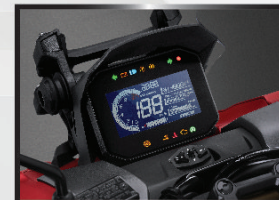
NEW FULL DIGITAL METER PANEL