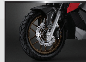
ANTI-LOCK BRAKING SYSTEM (ABS) WITH WAVY DISC BRAKES