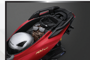
NEW LARGE LUGGAGE BOX