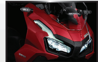
ALL LED LIGHTING SYSTEM