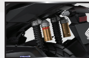
TWIN SUBTANK REAR SUSPENSION