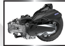
NEW GENERATION 157cc, 4-VALVE, LIQUID COOLED, eSP+ ENGINE