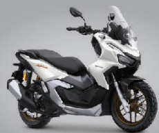
Matte Pearl Crater White