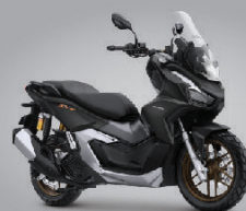
Matte Gunpowder Black Metallic