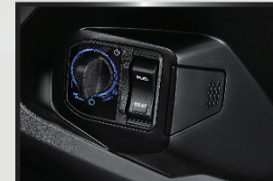
HONDA SMART KEY SYSTEM