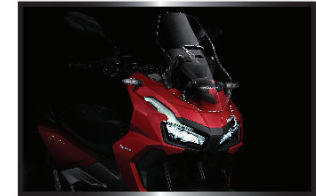
NEW HIGHER ADJUSTABLE WIND SCREEN