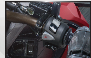
IDLING STOP SYSTEM