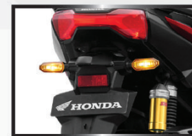
LED TAILLIGHT WITH EMERGENCY STOP SIGNAL (ESS)