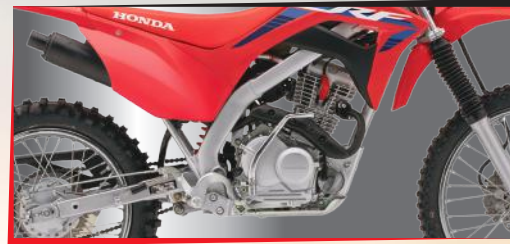
STEEL BODY FRAME