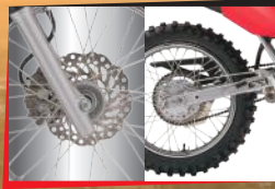
WAVY DISC FRONT BRAKE MECHANICAL DRUM REAR BRAKE