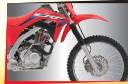
31mm TELESCOPIC FRONT SUSPENSION