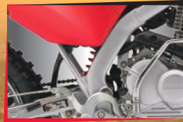
PRO-LINK REAR SUSPENSION