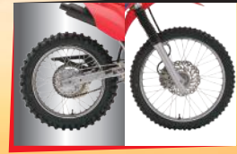
OFF-ROAD READY WHEEL TYPE