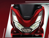
STYLISH HEADLIGHT DESIGN