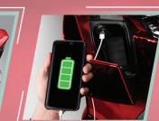
SECURED FRONT POCKET W/ USB CHARGER