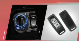
SMART KEY W/ ANSWER BACK & ANTI-THEFT ALARM