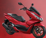
MATTE SOLAR RED METALLIC