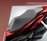
2-TONE SEAT DESIGN