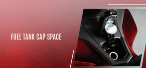
FUEL TANK CAP SPACE