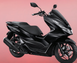
ASTEROID BLACK METALLIC