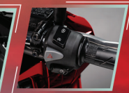
HAZARD & ISS SWITCH