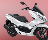
PEARL FADELESS WHITE