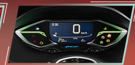
DIGITAL METER PANEL