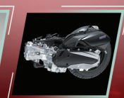
POWERFUL 160CC ENGINE, 4-VALVE