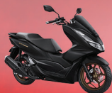
MATTE GUNPOWDER BLACK METALLIC