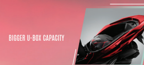
BIGGER U-BOX CAPACITY