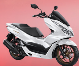
PEARL FADELESS WHITE