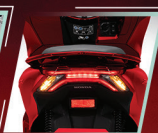
X-SHAPED 3D TAIL LIGHT