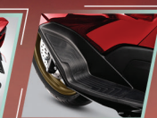
STEP FLOOR MATTING