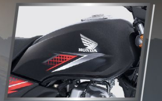
CLASSIC FUEL TANK