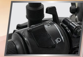
EASY CHOKE CONTROL