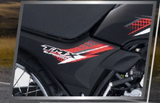
DURABLE SIDE COVER