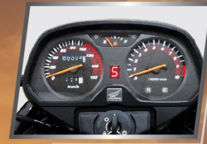
INFORMATIVE METER PANEL