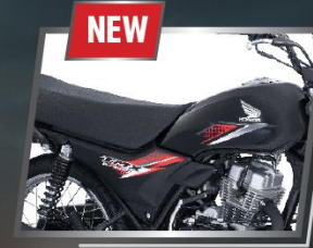
NEW STRIPE DESIGN