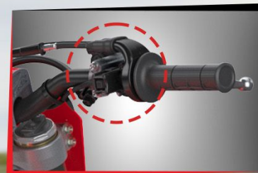
HRC LAUNCH CONTROL