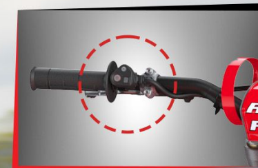
ENGINE MODE SELECT BUTTON