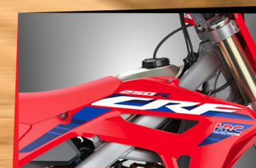
6.3 LITERS FUEL TANK CAP