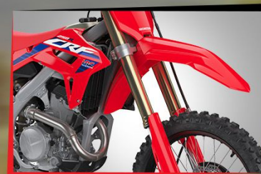
49mm UP SIDE DOWN FORK (Showa Brand)