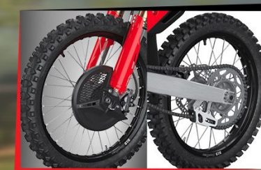
21-inch FRONT & 19-inch REAR WHEELS