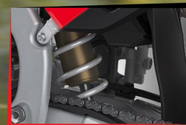
PRO-LINK REAR SUSPENSION (Showa Brand)