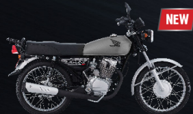
Matte Armored Silver Metallic