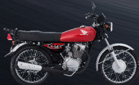
Candy Ruby Red