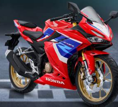
Winning Red (Honda Tri-Color)