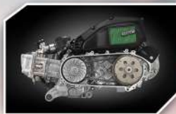
125CC, LIQUID-COOLED, PGM-FI, ESP ENGINE

Power meets efficiency and proven Honda innovation in the liquid-cooled engine of The New CLICK125. Experience game-changing performance with every ride.