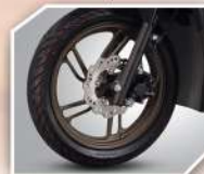
CHAINED BRAKE SYSTEM

All your essential riding information in clear full display.