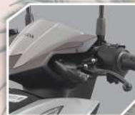
PARK BRAKE LOCK

Honda's signature combined brake system keeps The New CLICK125 stable during deceleration and steady with efficient brake control.