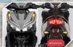
ALL LED LIGHTING SYSTEM

For extra safety while at a standstill by keeping brakes engaged through a lever lock.