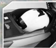
TOP LUGGAGE BOX

The New CLICK125 features an all LED headlight, tail light and winker for a safer ride.