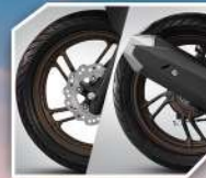
NEW MATTE BROWN CAST WHEEL COLOR WITH WIDER TUBELESS TIRES

Featuring a new two-toned color combination with a striking sporty finish. *Available for Special Edition Only