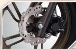
WAVY DISC BRAKE

A necessity for the everyday rider. Charge your device with The New CLICK125's Charging Port.