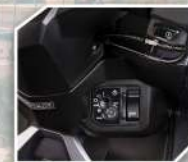
SECURE KEY SHUTTER

Conveniently placed, spaciouly accommodating. Store your helmet and personal belongings safely.