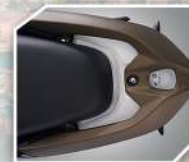
NEW MATTE BROWN COLORED REAR GRAB

Honda innovation at its finest. This magnetic safety ignition also doubles as seat eject button.