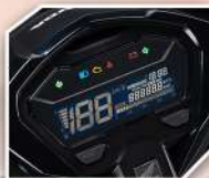
FULL DIGITAL METER PANEL

Hit the brakes in style. The New CLICK125 features wavy disc brake for next-level stopping.