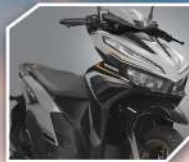
NEW TWO-TONED COLOR COMBINATION

Power meets efficiency and proven Honda innovation in the liquid-cooled engine of The New CLICK125. Experience game-changing performance with every ride.