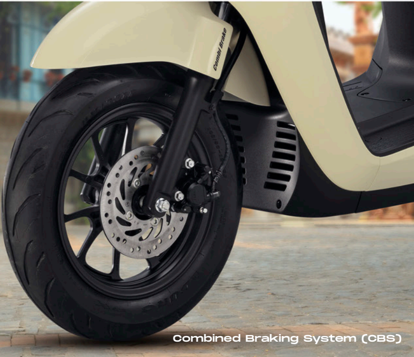
Combined Braking System (CBS)