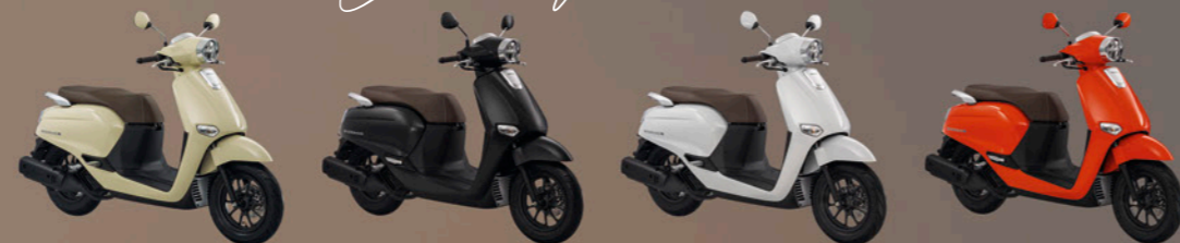
Virgin Beige Matte Gunpowder Black Metallic Pearl Jubilee White Piquant Orange