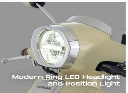
Modern Ring LED Headlight and Position Light