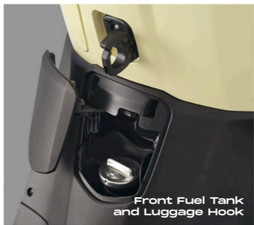
Front Fuel Tank and Luggage Hook