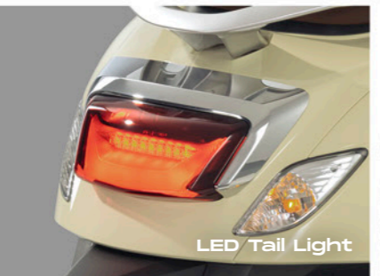
LED Tail Light