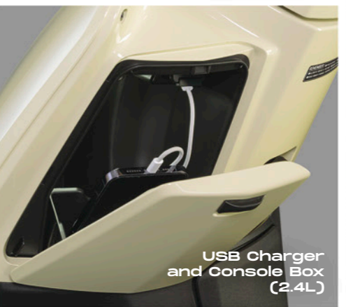
USB charger and Console Box (2.4L)