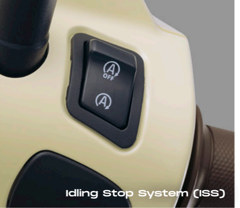
Idling Stop System (ISS)