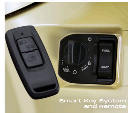
Smart Key System and Remote