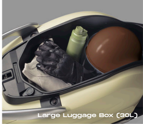
Large Luggage Box (30L)