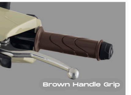
Brown Handle Grip