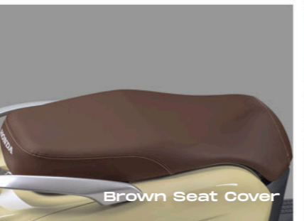
Brown Seat Cover