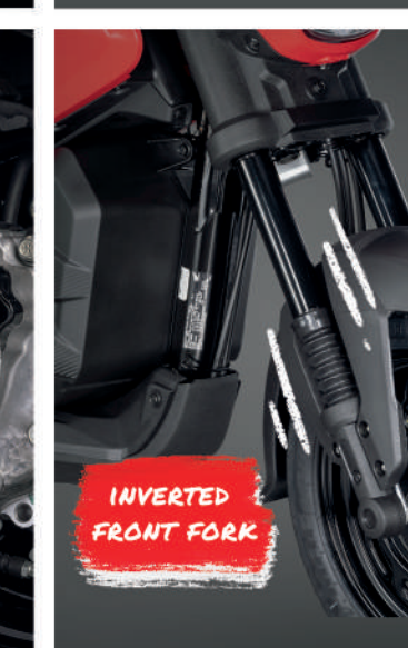
INVERTED FRONT FORK