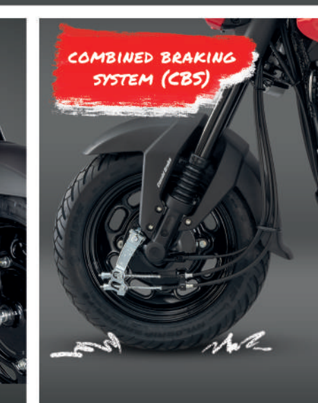
COMBINED BRAKING SYSTEM (CBS)