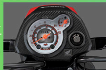
USER-FRIENDLY METER PANEL