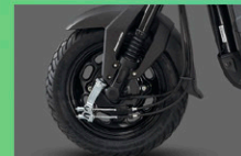
COMBINED BRAKING SYSTEM (CBS)