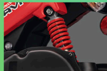
DURABLE REAR SHOCK