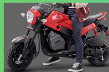
LOW SEAT HEIGHT