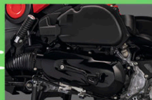
AUTOMATIC TRANSMISSION ENGINE WITH HONDA ECO TECHNOLOGY (HET)