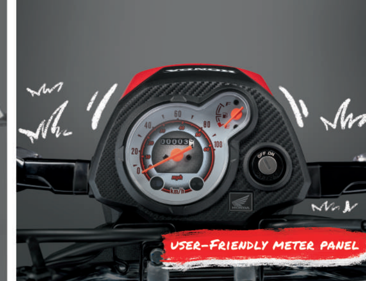
USER-FRIENDLY METER PANEL