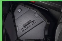
INTEGRATED STORAGE AREA