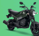
RANGER GREEN R