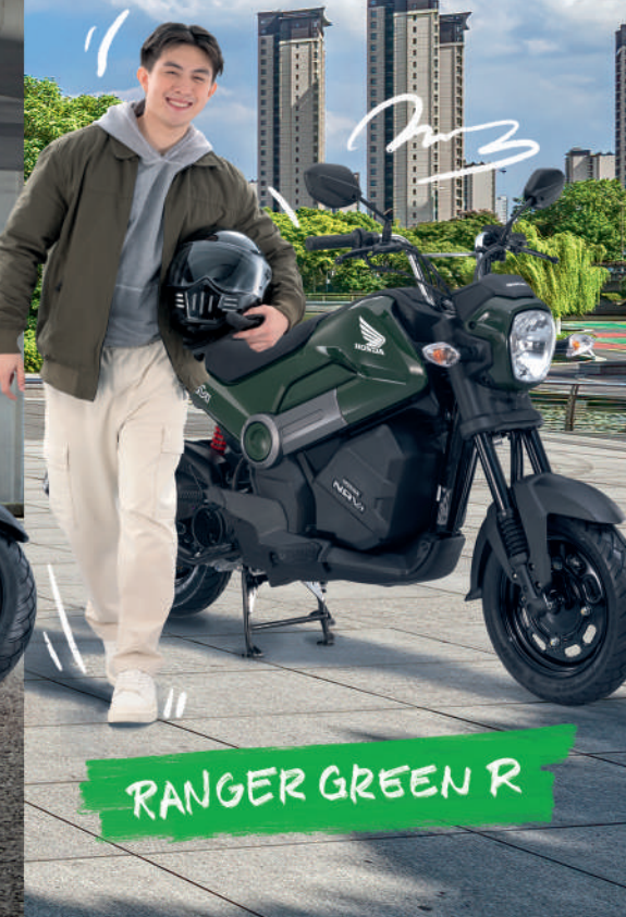
RANGER GREEN R