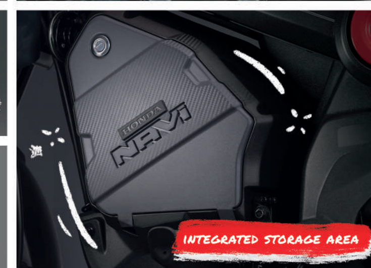
INTEGRATED STORAGE AREA