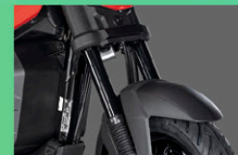
INVERTED FRONT FORK